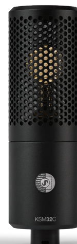
KSM32C/HM Cardioid Condenser Microphone (Stage Kit)