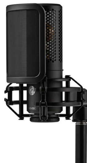
KSM32C/SM Cardioid Condenser Microphone (Studio Kit)